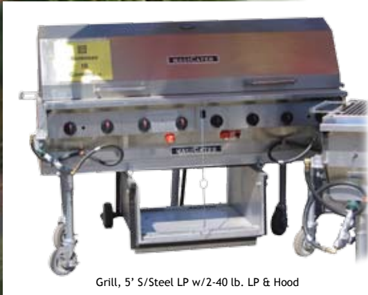
Grill, 5' S/Steel LP w/2-40 lb. LP & Hood